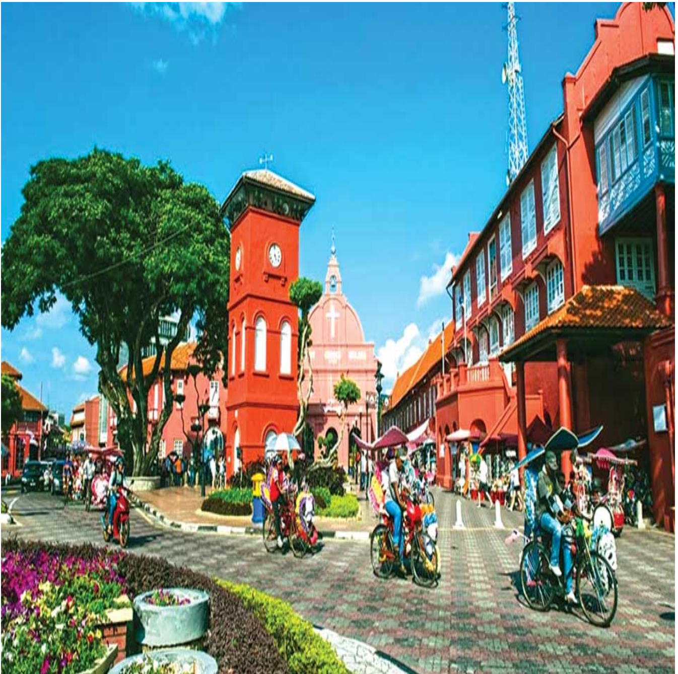
Malaysia becoming top choice for outbound travel currently

According to Bangladesh Tourism Board statistics, outbound travel has grown steadily at an average of 12-15 percent per year over the last five years. Analysts believe that 2026 could surpass previous years due to a combination of favorable visa policies, diversified destinations, and increased purchasing power among urban travelers.