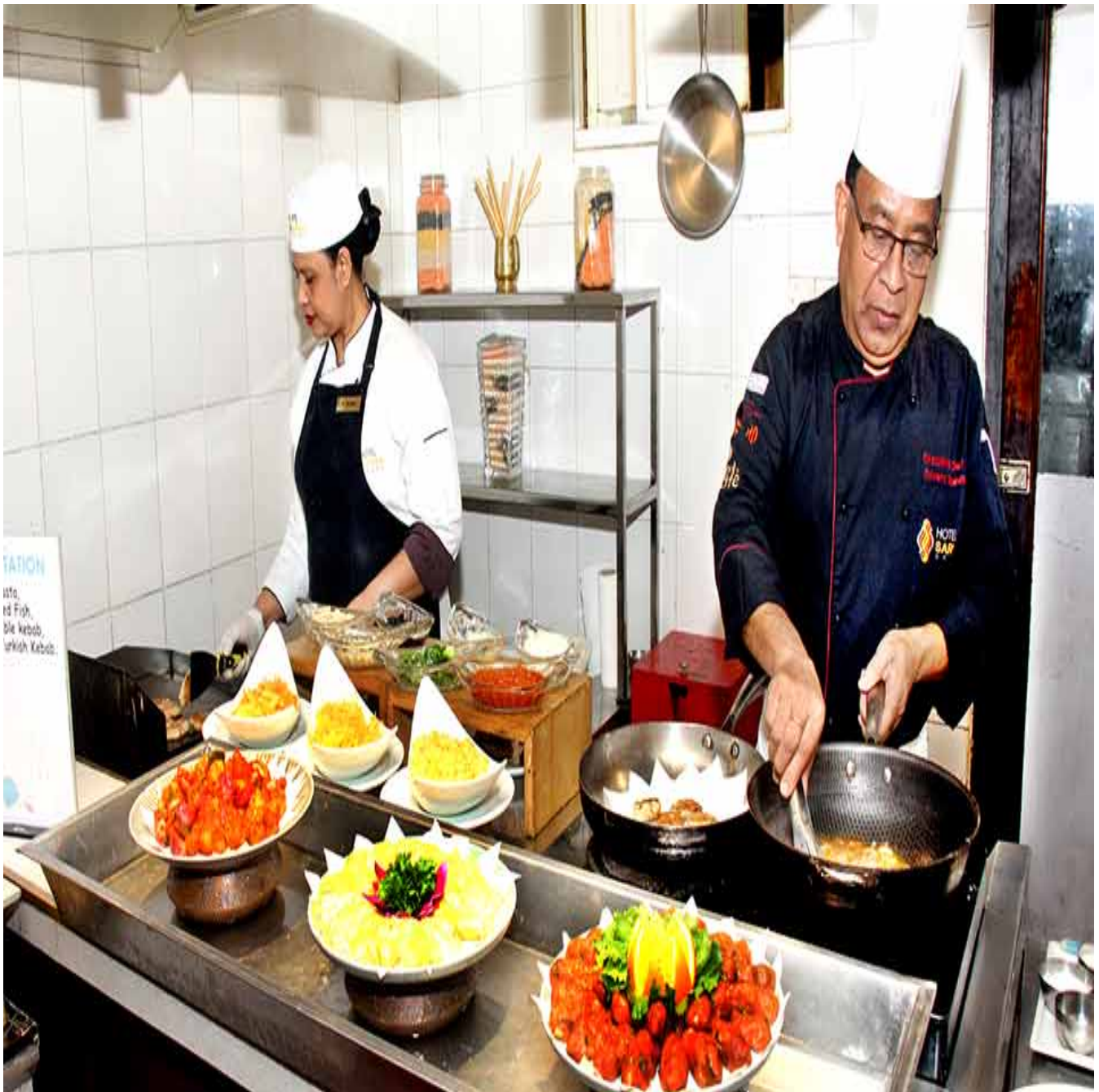
Hotel Sarina Dhaka

This Ramadan, Hotel Sarina Dhaka offers Muslims an opportunity to enjoy an exclusive iftar buffet spread.