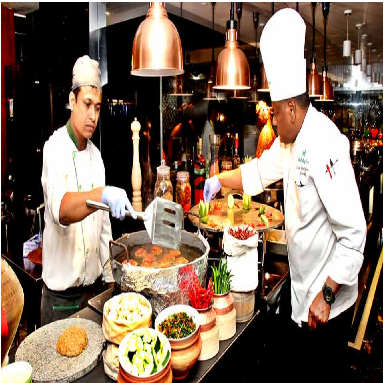
Holiday Inn Dhaka

Holiday Inn Dhaka City Centre invites guests to experience Ramadan