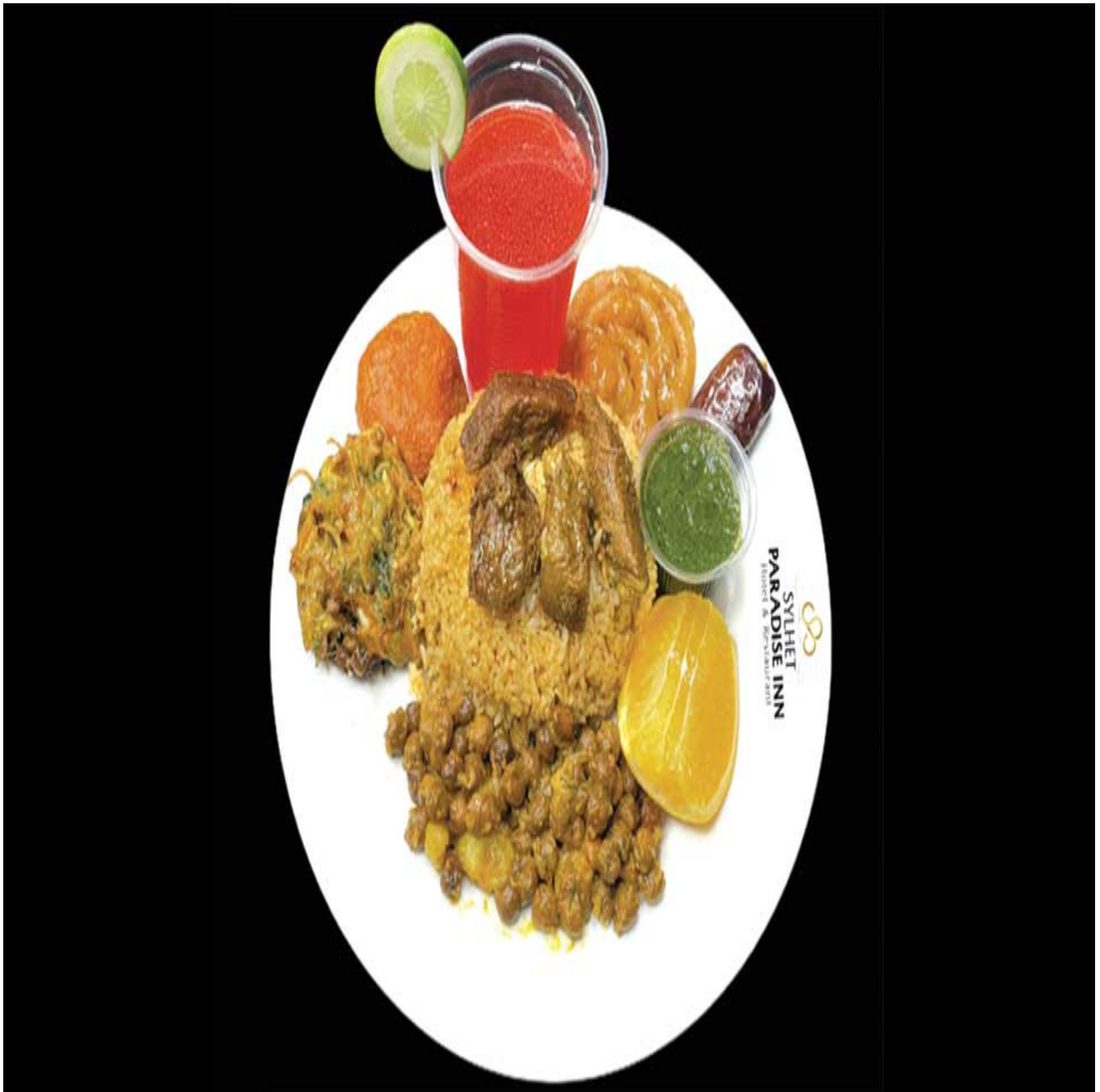
Sylhet Paradise Inn

This Ramadan, Sylhet Paradise Inn offers a variety of delicious set menus.