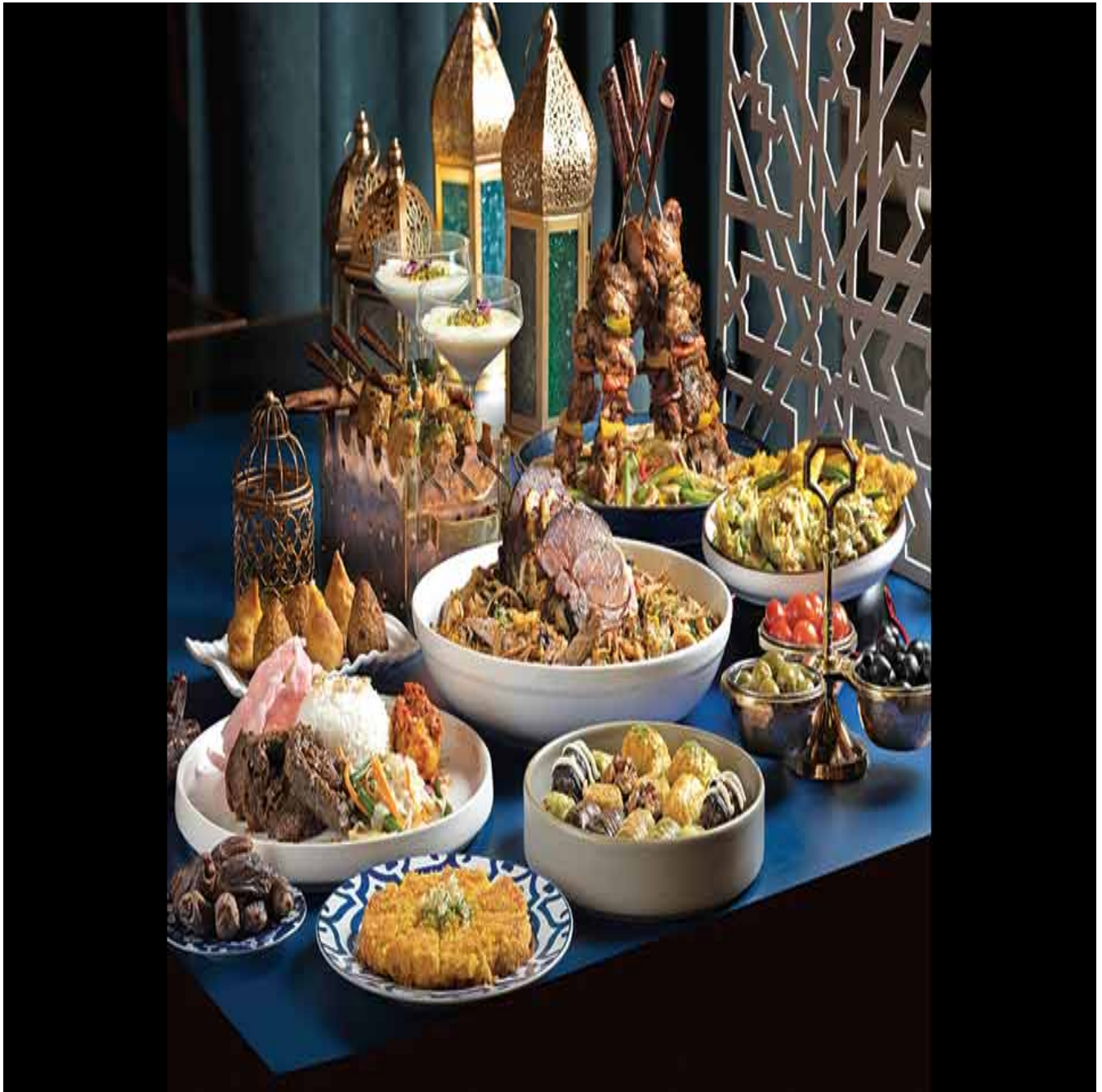
Le Meridien Dhaka

This Ramadan, Le Méridien Dhaka is offering an opulent dining experience featuring a grand buffet iftar cum dinner at BDT 11,500 net per person and an exclusive buffet suhoor at BDT 8,500 net per person.