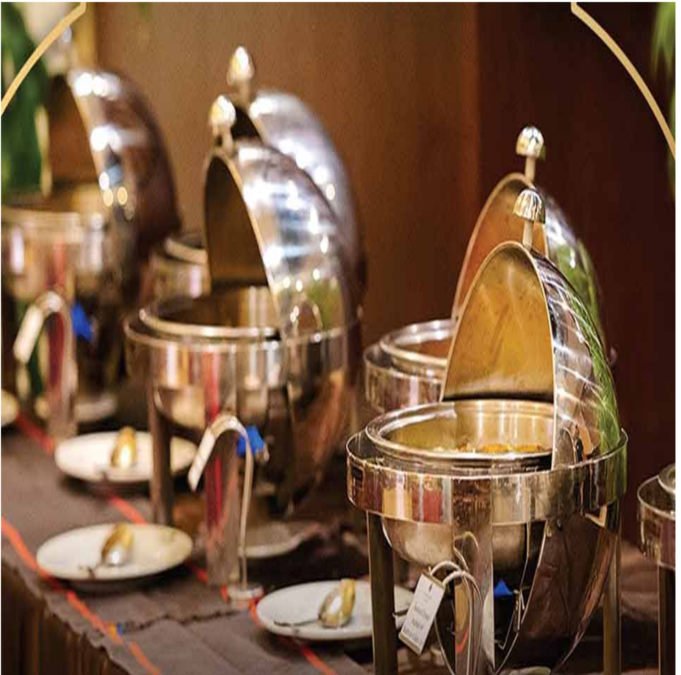
Hotel Grand Park Barishal

This Ramadan, Hotel Grand Park in Barishal offers a unique culinary experience, featuring a diverse selection of traditional and modern dishes to satisfy every taste.