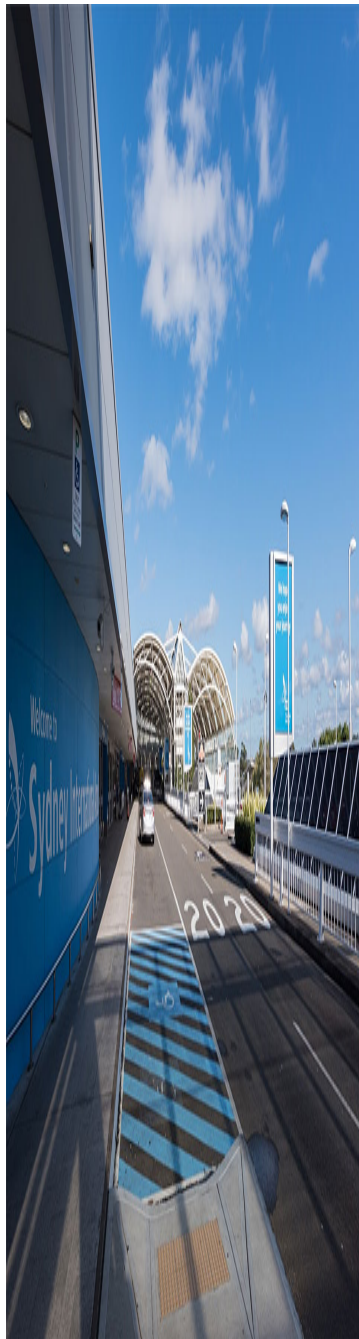
Sydney Airport in Sydney, Australia

Notable fact: Australia's vast outback and dispersed population centers contribute to its high airport count.