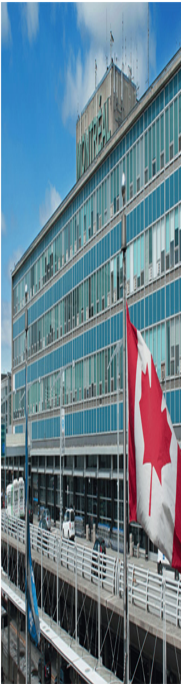
Montréal-Pierre Elliott Trudeau International Airport, Quebec, Canada

Notable fact: Canada's large landmass and remote communities require a widespread network of airports.