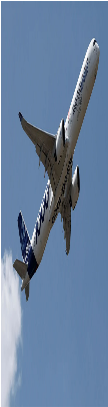
Airbus A350-1000 performs an exhibition flight during International Paris Airshow at Le Bourget Airport in France on June 16, while Boeing opts out

That dominance underscores Airbus's recent advantage in both visibility and new business wins.