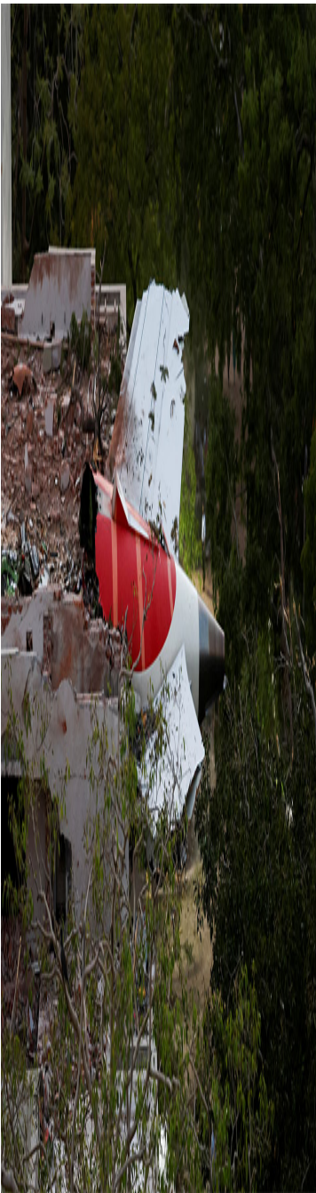
Debris from Air India flight crash in Ahmedabad operated by Boeing 787-8 on June 12 that killed 253 onboard and 39 on ground

This marks the first fatal accident involving a Dreamliner since its 2011 debut, thrusting the model back under intense scrutiny.