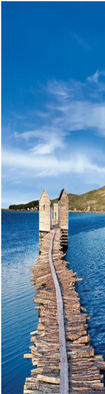
Western Newfoundland and Labrador, Canada

Fly from Dhaka to Toronto, then connect to Deer Lake, Goose Bay, or St John's for access to Western Newfoundland and Labrador. New eco-friendly experiences, including interactive boardwalks at Red Bay and upgraded visitor centers at Gros Morne, make it a compelling and sustainable destination.