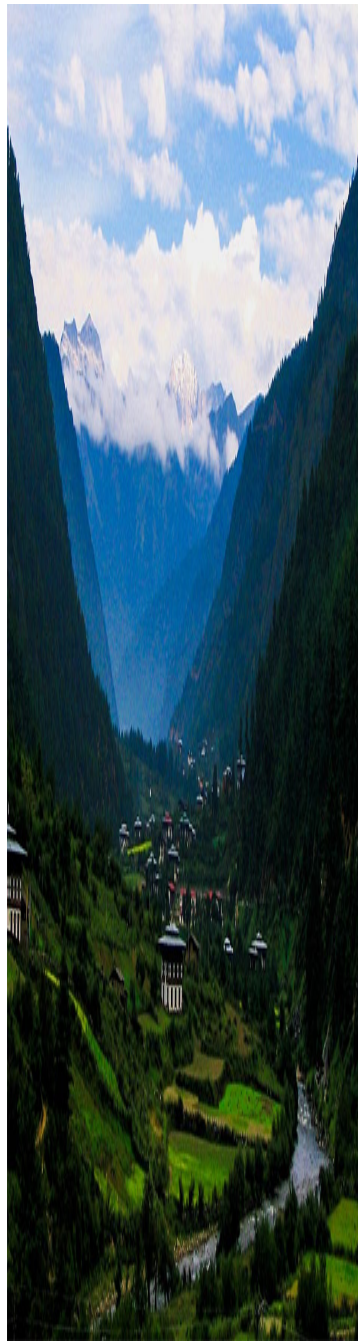
Haa Valley, Bhutan

Fly from Dhaka to Paro (Bhutan's only international airport) via connecting routes through Kolkata or Delhi, then take a short scenic drive to Haa. Here, visitors can explore yak pastures, ancient temples, and protected forests home to red pandas and snow leopards—all while staying in locally owned homestays or eco-camps.