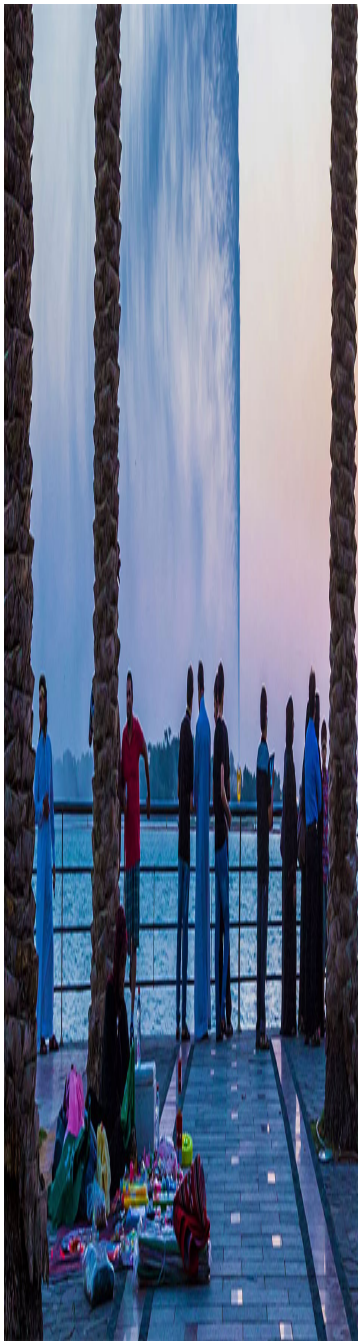
Shooting water over 300 meters into the sky, King Fahd Fountain is Jeddah's iconic landmark—best admired as it glows against the night sky

Not far from the Al Rahma Mosque, famously built on stilts above the sea, visitors can pause at one of many contemporary sculptures scattered along the coast. These art pieces—some gifts from international artists during the city's early days of expansion—symbolize Jeddah's role as a cultural melting pot, historically welcoming pilgrims, traders, and travelers through its ports.