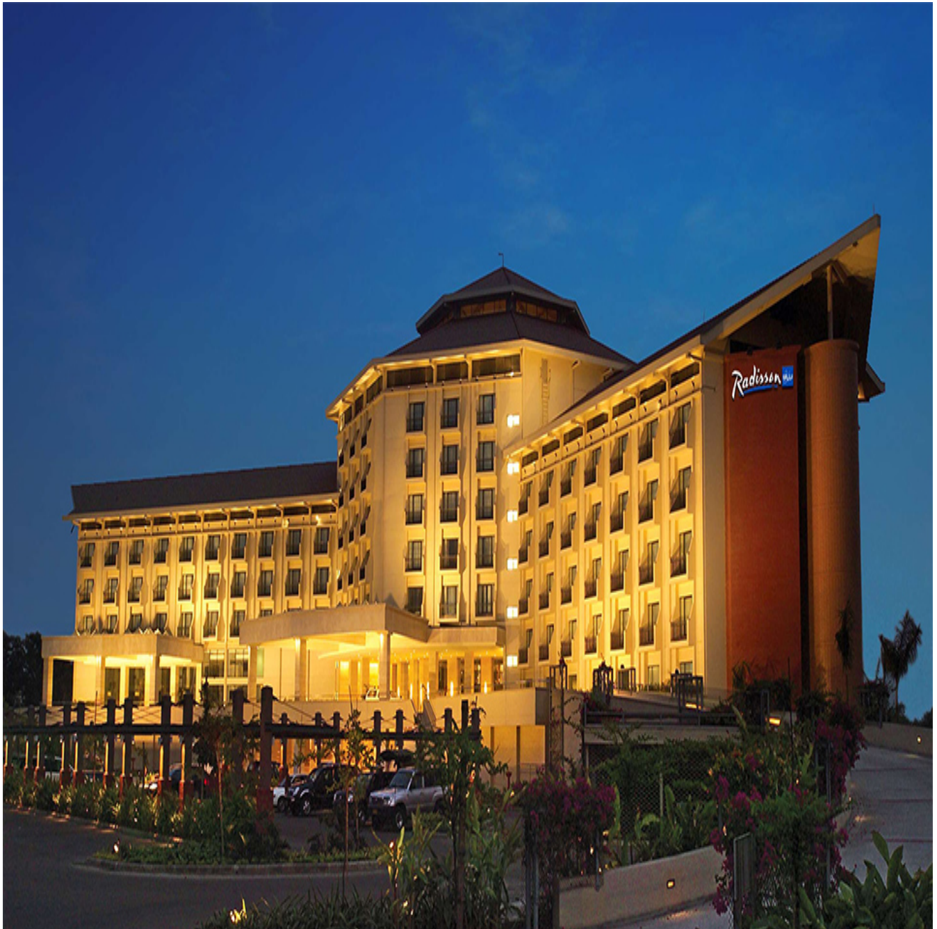
Radisson Blu Dhaka Water Garden

At Le Méridien Dhaka, New Year's Eve takes on a grand scale with a premium buffet dinner supported by multiple bank offers, alongside exclusive set menus at Favola, Olea, and the Pool Bar and Lounge — each designed for guests seeking a more intimate yet upscale celebration.