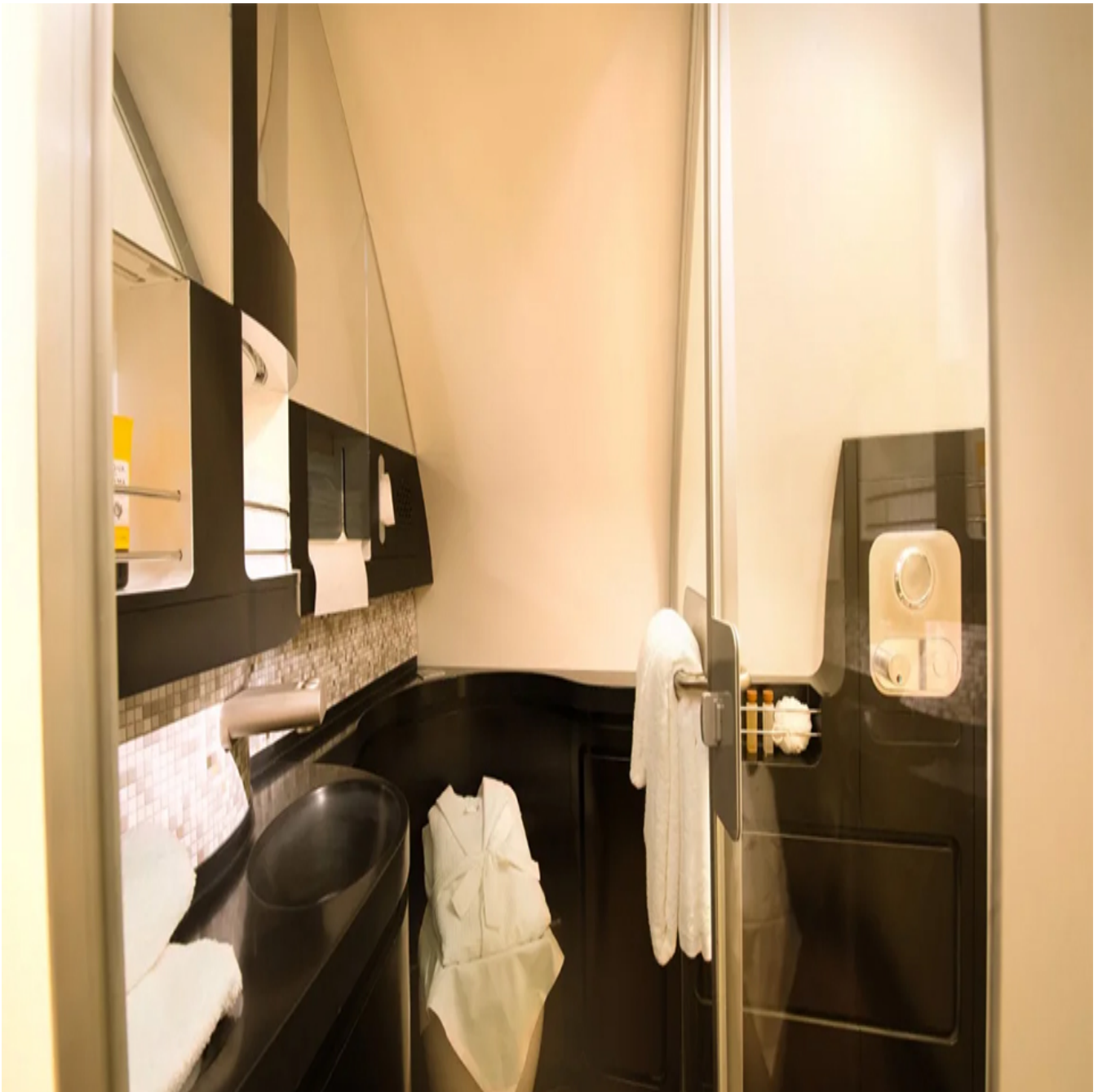
Enjoy a warm and soothing shower in your private ensuite

It is less spectacle, more design statement.