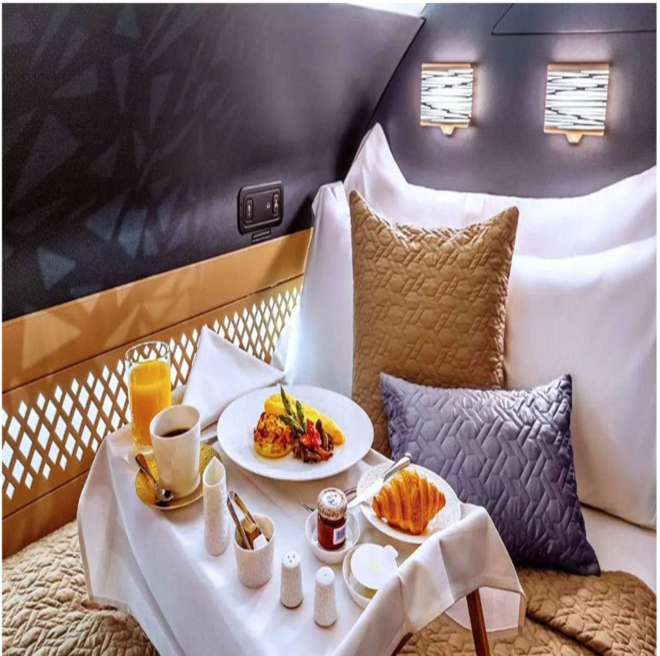
Choose to eat in bed or the living room, from gourmet cuisine to lighter refreshments

On long-haul sectors from Abu Dhabi to London, New York, or Sydney, the separation of living space and sleeping space turns a flight into something closer to an overnight stay.