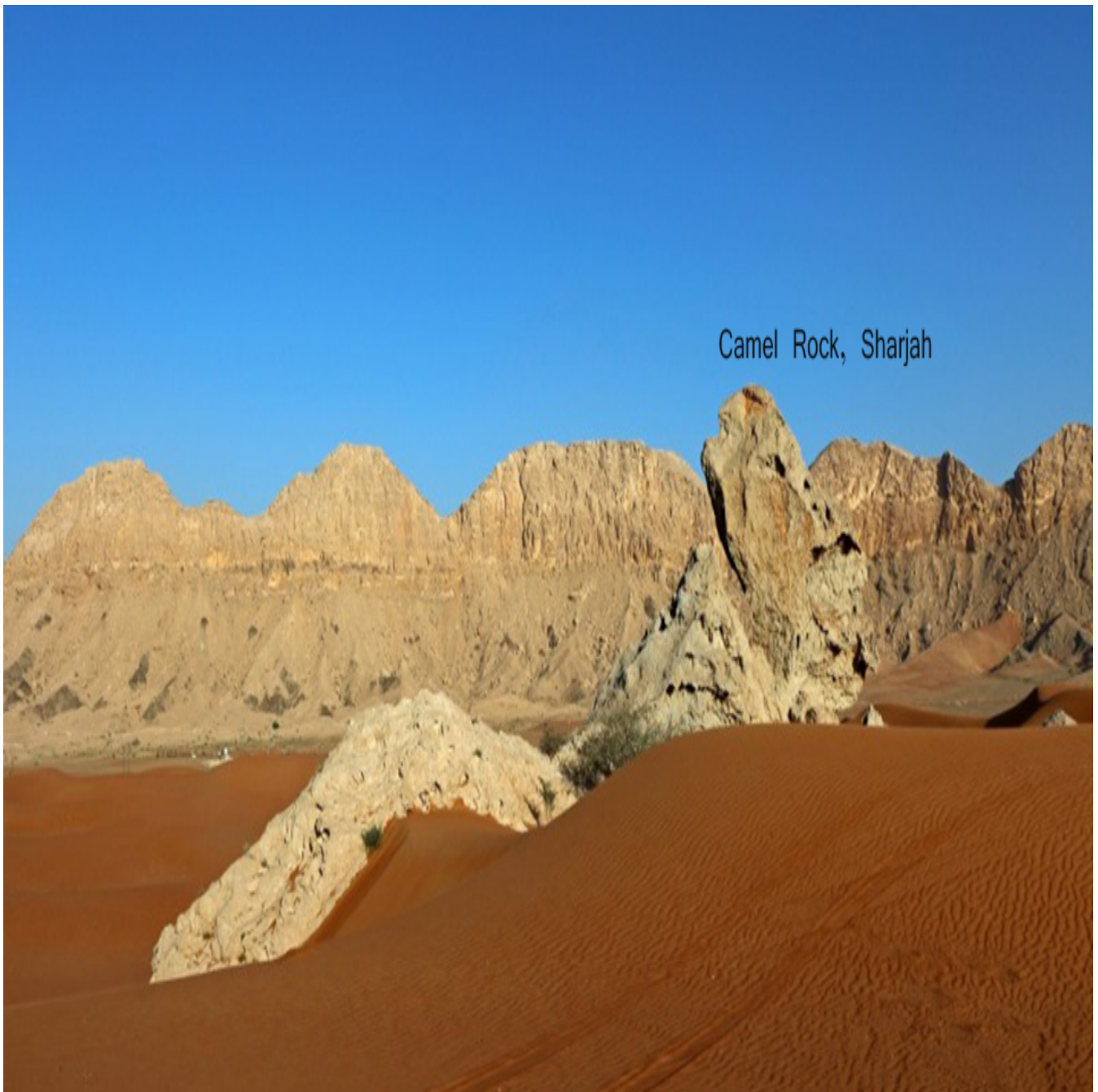
Camel Rock, Sharjah

'Valley of the Caves' at Al Faya Mountain: Jebel Al Faya, shaped like a dragon's back, is an impressive mountain stretching along the Al Faya desert. At its North-Eastern point, Arabian Adventures' guides take visitors to visit the 'Valley of the Caves'.