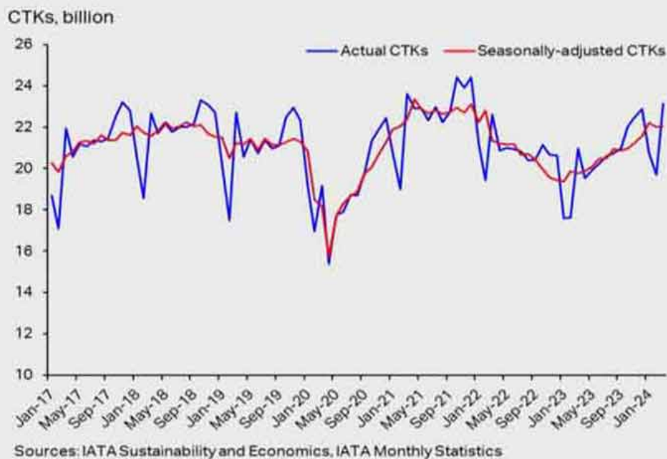
Chart 1 – Global CTKs (billion per month)

Dhaka: Total demand of air cargo globally rose by 10.3 per cent in March 2024 compared to March 2023 levels (11.4 per cent for international operations), marking the fourth consecutive month of double-digit year-on-year growth. At the same time, air cargo capacity increased by 7.3 per cent compared to March 2023 (10.5 per cent for international operations).