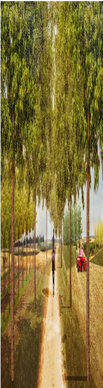
Representative image of the Metropolitan Forest